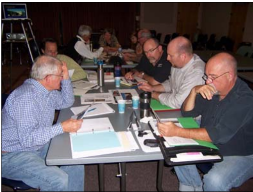
CHC, ARC, and staff members work through an exercise.

The training included a discussion of historic preservation incentives used in some cities, including Mills Act, technical assistance grants, and regulatory relief. The group discussed how other areas handle historic resource designation and protection. The materials presented a hierarchy of options when reviewing new buildings in historic districts, with the resulting goal that the process will be fair, predictable, and efficient.