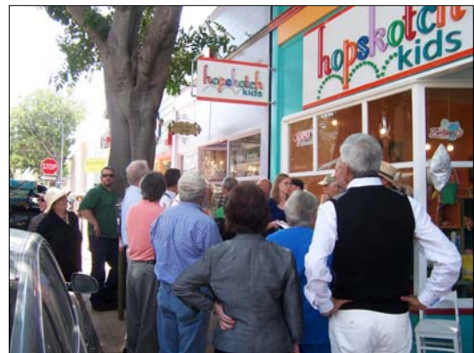
Participants on a tour of the Downtown.

New Cal Poly Bus Stops: As part of long term plans for circulation on campus, Cal Poly recently closed a portion of South Perimeter Road in front of the University Union and constructed new bus stops along Grand Ave near the intersection of Perimeter Road, just in time for Fall Quarter. The two new Performing Arts Center (PAC) stops replace those at the Vista Grande restaurant, PAC parking lot, Mustang Stadium, the Graphic Arts building, the University Union and in front of Mott Gym. In addition, two new bus stops were constructed at the Kennedy Library, which has been envisioned by the University as the ultimate location for the